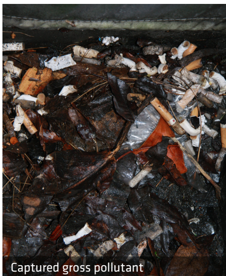
Captured gross pollutant