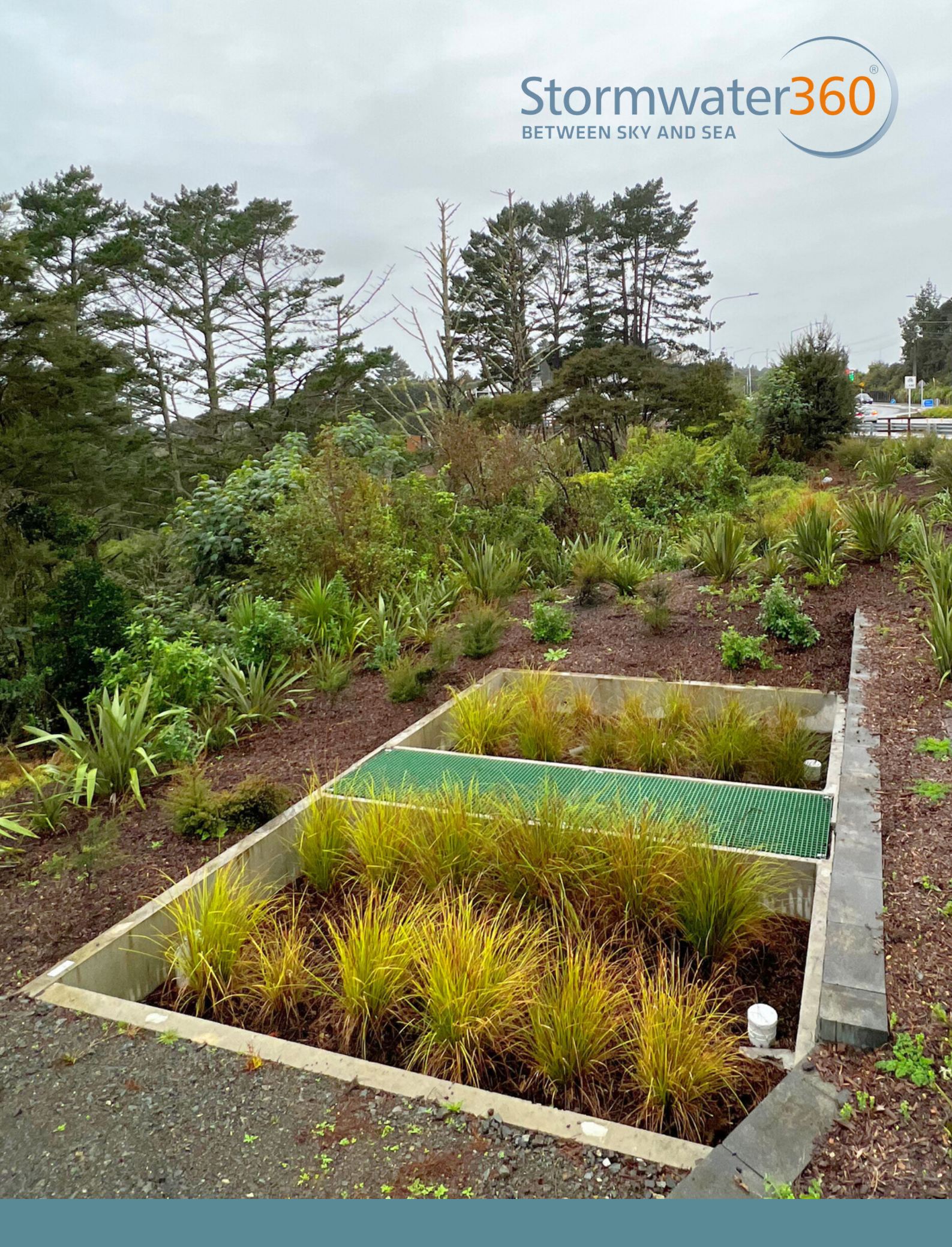
Filterra® Life Cycle Cost Analysis