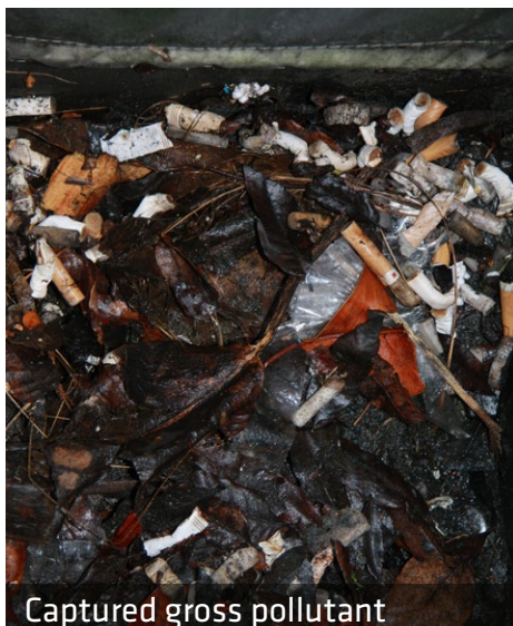
Captured gross pollutant